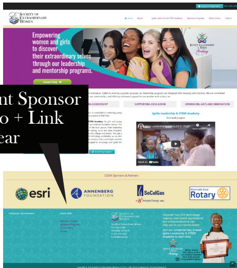
SOEW Website home page